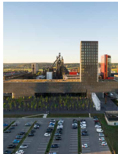
Campus Belval, University of Luxembourg